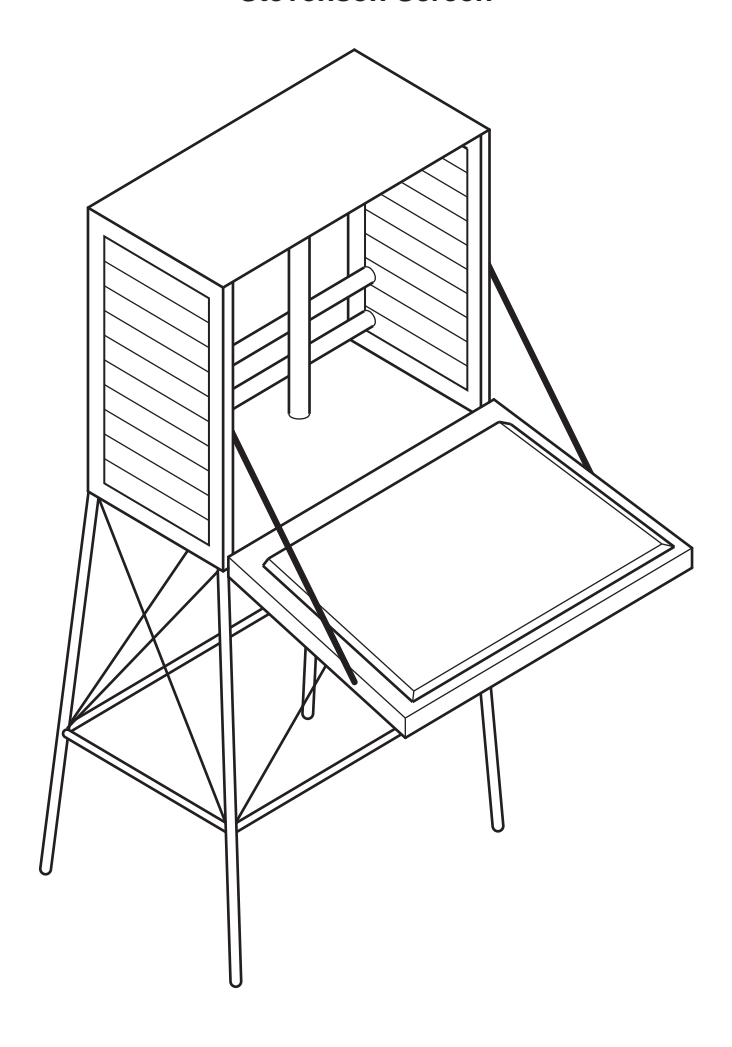
Fig. 1.2 for Question 1